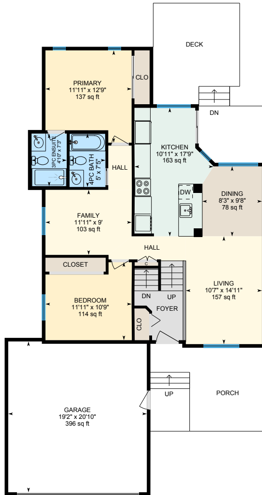
Main Floor Exterior Area 1099.51 sq ft

Main Building: Total Exterior Area Above Grade 1099.51 sq ft